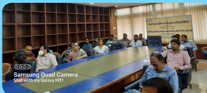
Samsung Quad Camera Shot with my Galaxy M31