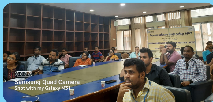
Samsung Quad Camera Shot with my Galaxy M31