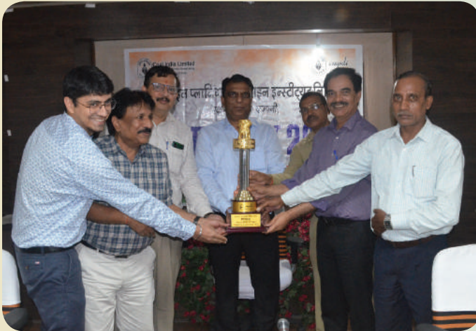
1st Prize for Maximum Work in Hindi- S&T Dept.