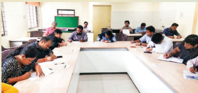
Essay Writing Competition