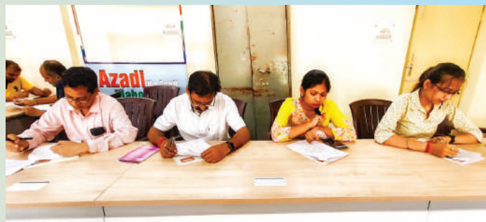
Hindi General Knowledge