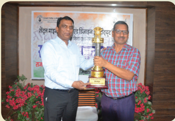
Best Regional Institute - RI-VI, Singrauli.