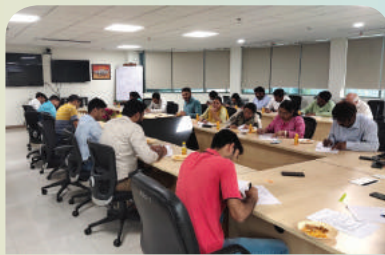
Notesheet Drafting Competition.