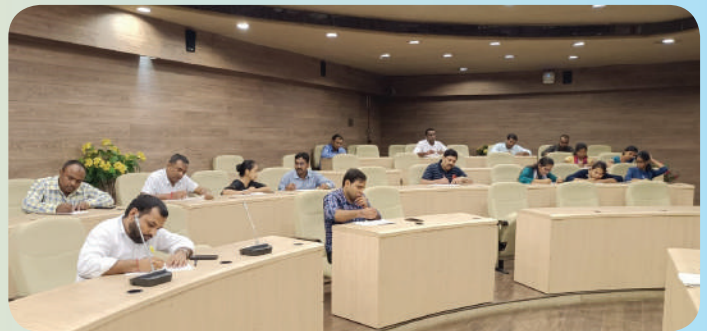
Essay Writing Competition.