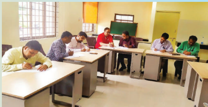
Notesheet Drafting Competition.