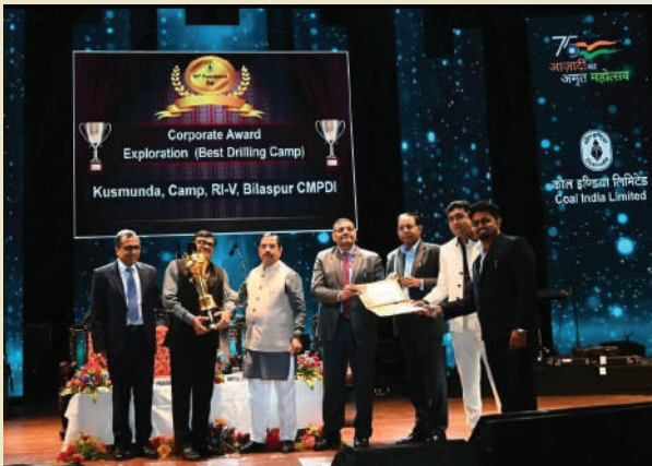
Exploration (Best Drilling Camp) Kusmunda Camp, RI-V, Bilaspur.