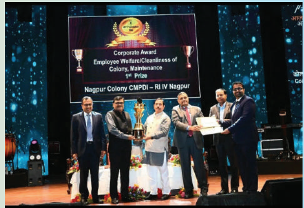
Employee welfare/Cleanliness of Colony, Maintenance-RI-IV, Nagpur.