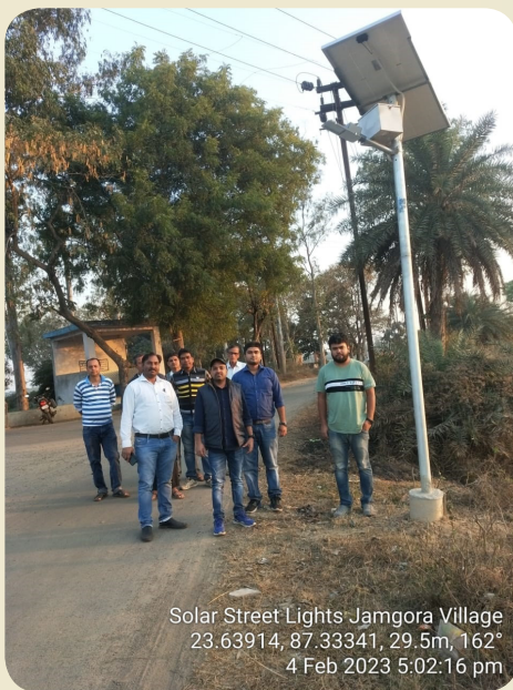
Solar Street Lights Jamgora Village 23.63914, 87.33341, 29.5m, 162° 4 Feb 2023 5:02:16 pm