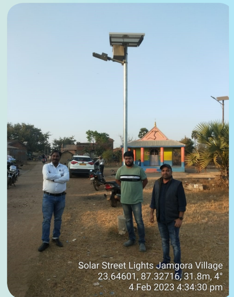
Solar Street Lights Jamgora Village 23.64601, 87.32716, 31.8m, 4° 4 Feb 2023 4:34:30 pm

CMPDI's, Regional Institute -I, Asansol under CSR Installed 100 nos. of Solar Powered Street Lights in Jamgora Village, (Dist) Paschim Bardhaman, West Bengal at a cost of 15.10 lakhs. These Solar Street lights impacting the life of people in a positive way in accessing the roads, markets during night time apart from being economical and environmental friendly. CSR Committee along with OIC Mollarpur Sub-Camp visited the Jamgora village and interacted with the people of the village to get the feedback. People expressed their happiness towards this CSR initiative of CMPDI.