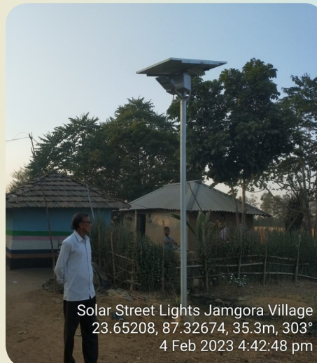
Solar Street Lights Jamgora Village 23.65208, 87.32674, 35.3m, 303° 4 Feb 2023 4:42:48 pm