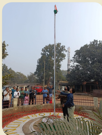
Singrauli Exploration Camp