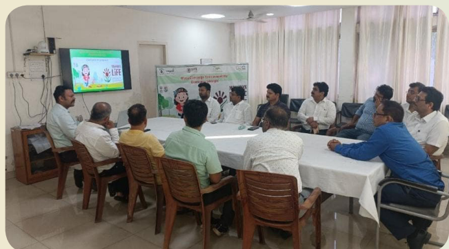
Interactive session on Mission LiFE at RI-VI, Singrauli.