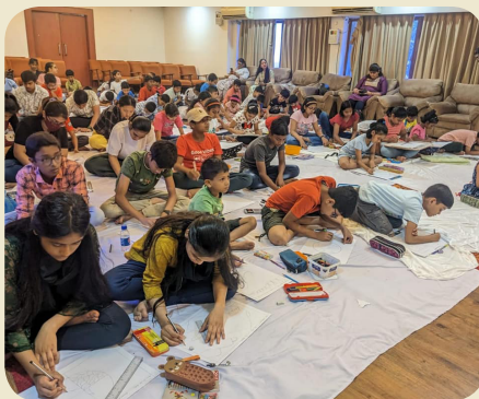
CMPDI (H Q).