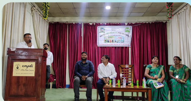
Awareness session on 'Waste segregation' in association with Bhubaneswar Municipal corporation at RI-VII, Bhubaneswar.