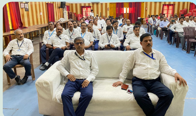
Lecture on, "हरित पर्यावरण और स्वस्थ जीवन" at RI-V, Bilaspur.