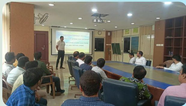
Awareness Program on "Global Environmental Issues" at RI-II, Dhanbad.