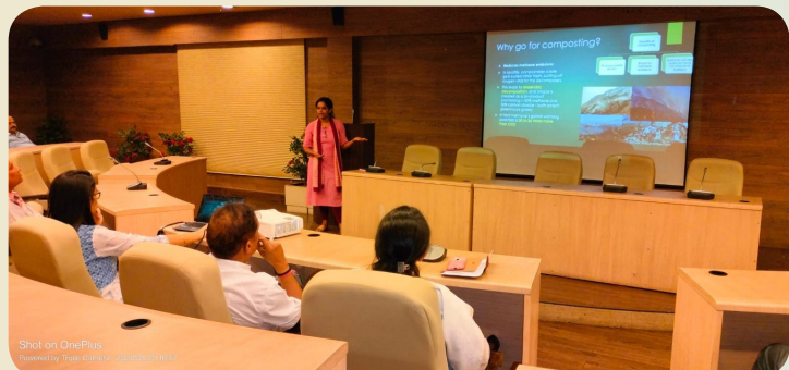
Seminar on "Home Composting" at CMPDI(HQ), Ranchi.