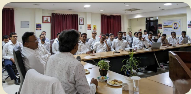
Awareness Program on "Significant Global Environmental Issues" at RI-VII, Bhubaneswar.